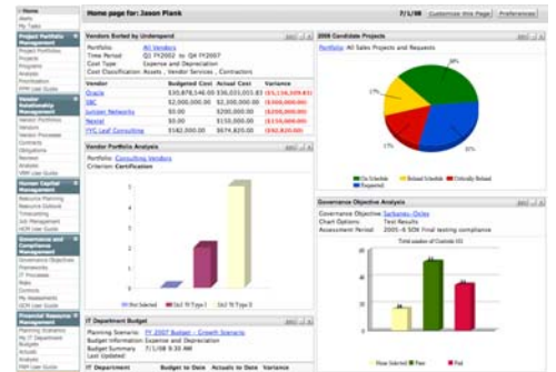
BMC IT Business Management Suite dashboard