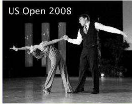
US Open 2008