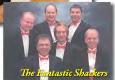
The Fantastic Shakers

For additional information check out our website - www.abscdj.com